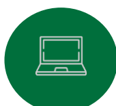
Mistro Farm 5